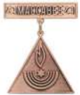
MACCABEE: FOR TIGER CUBS