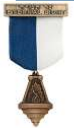
NER TAMID: FOR SCOUTS (First level award)