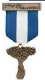
ETZ CHAIM: FOR SCOUTS (Second level award)