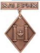
ALEPH: FOR CUB SCOUTS [WOLVES, BEARS, WEBELOS]